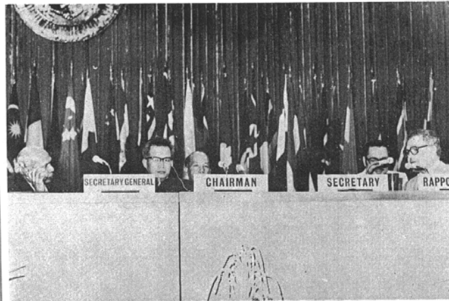
In his capacity of Deputy-Chairman of the Fifth Summit Conference of the Non-aligned Countries, the President of the Presidium of the State of Democratic Kampuchea KHIEU SAMPHAN presiding over a plenary session of the Conference.

The principles of non-alignment are the resolute will and deep aspirations of thousands of millions of